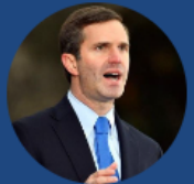
Kentucky Governor Andy Beshear

Every young adult in Kentucky counts. We want to do everything we can to ensure each one of these graduating seniors is on a path for success – a path that can change in the future if their goals change. We are at a unique moment in time. There's never been more opportunity to get higher education and training, and for the first time in my lifetime we have more jobs than people to fill them. We want to give these students a chance to select that path they want to be on before they graduate.