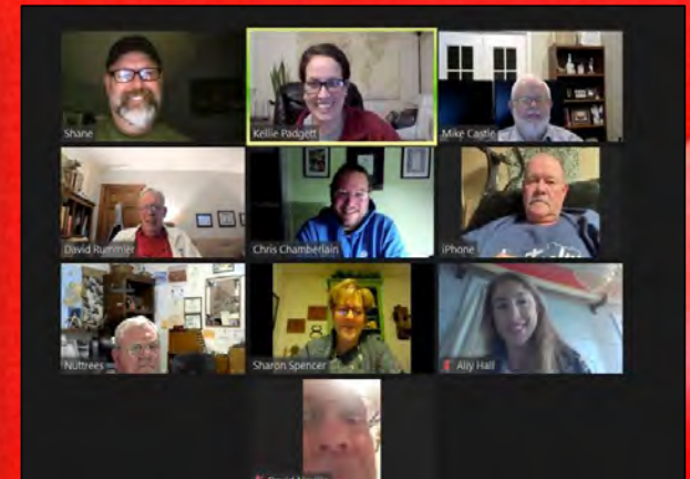
Monthly Zoom Calls