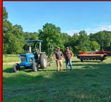
Internships with local producers