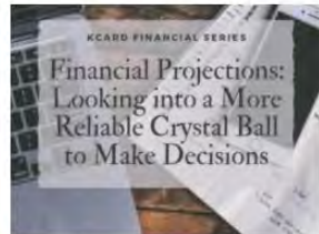
FINANCIAL PROJECTIONS: LOOKING INTO A MORE RELIABLE CRYSTAL BALL TO MAKE DECISIONS Aug 20, 2020