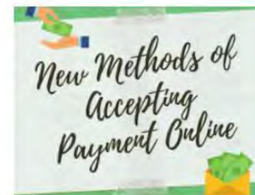
NEW METHODS OF ACCEPTING PAYMENTS ONLINE Apr 17, 2020