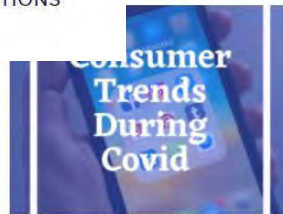
CONSUMER TRENDS – NOW AND GOING INTO FALL Sep 1, 2020