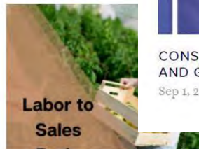
LABOR-TO-SALES RATIO: WHAT IS IT? AND WHY SHOULD I CARE ABOUT IT? Aug 11, 2020