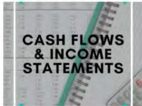
CASH FLOW AND INCOME STATEMENT: HOW ARE THEY DIFFERENT AND HOW DO THEY WORK FOR YOU? Jul 21, 2020