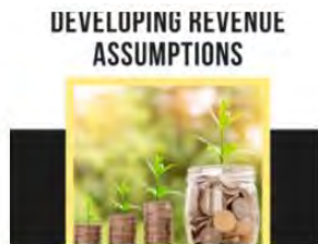
HOW MUCH AM I GOING TO MAKE? DEVELOPING REVENUE ASSUMPTIONS Aug 4, 2020