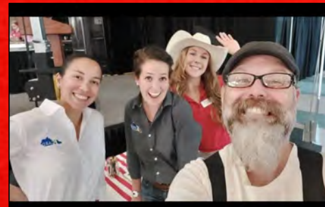
KY State Fair