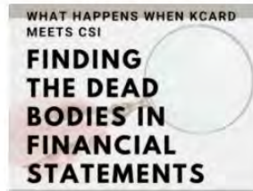
FINDING THE DEAD BODIES IN FINANCIAL STATEMENTS: WHAT HAPPENS WHEN KCARD MEETS CSI Aug 25, 2020